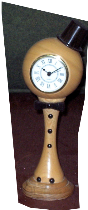
Another sample of the clock described above!

The hole for the clock recess is made using a sharp forstner bit. Having made the recess the front section of the recess can be sanded on a belt sander to produce a small flat area around the hole to allow the clock insert to sit flat against the wood. Before this can be done the finial is finished and it is at this point that things can go wrong due to the delicate nature of the finial so be extra careful. The piece was sanded and sealed and a finish of choice applied. The base of the pedestal is undercut to ensure the clock will stand upright and to allow for any movement in the timber when finished.