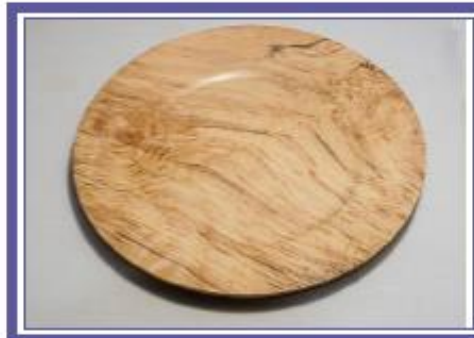
Seamus McKeefry - Experienced