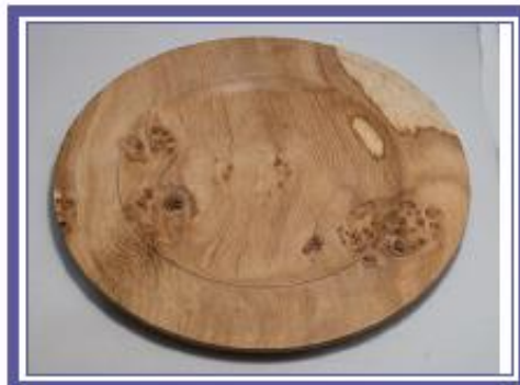
Cecil Barron - Advanced