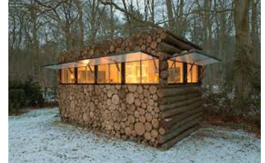
It's a Cabin!