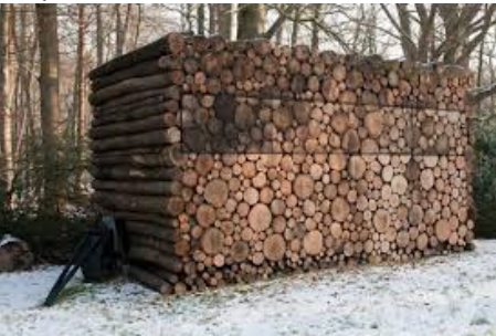
Answer later in the issue.