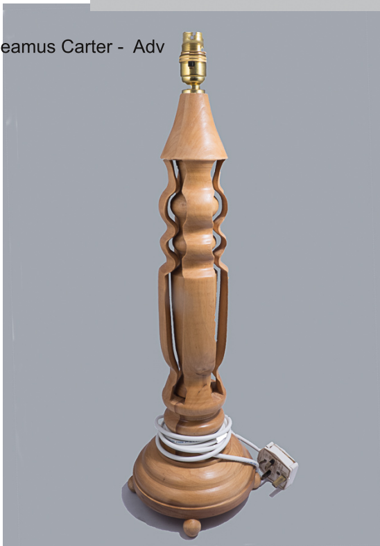
Seamus Carter - Adv