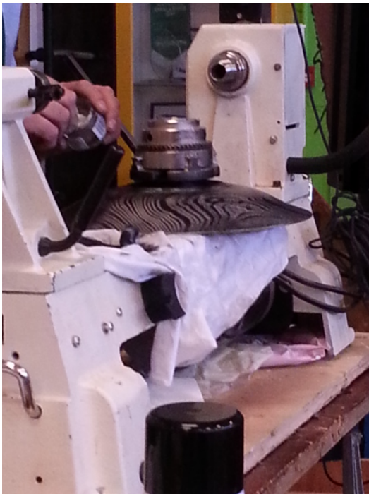
An ebonised platter in the making.