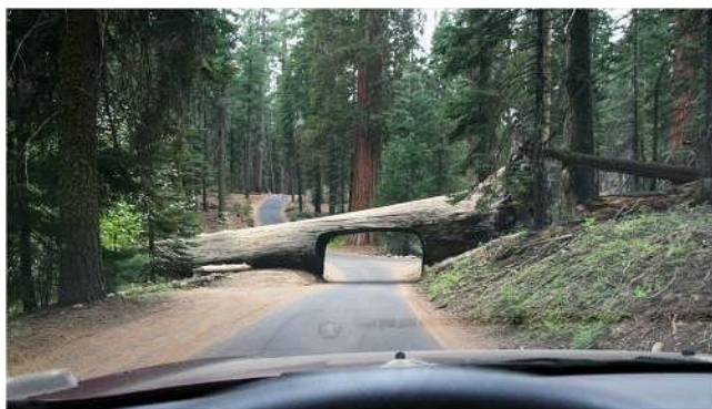
Experienced - An unusual tunnel in California's Sequoia National Park.