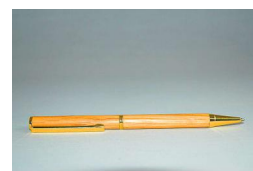
Exp - Graham Brislane