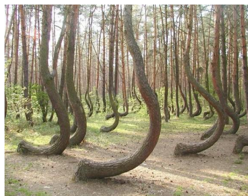
Beginners - Trees in the Hoia Forest in Cluj County, Romania.

Note: There were no pictures of competition entries available for June.