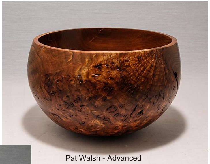
Pat Walsh - Advanced