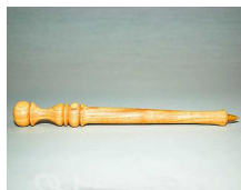
Adv - Una Sheeran

Who were the winners 10 years ago - June 2006?