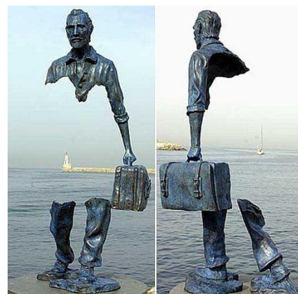
Artistic - A statue in France is created by Bruno Catalano.