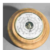
Exp - Malcolm Hill