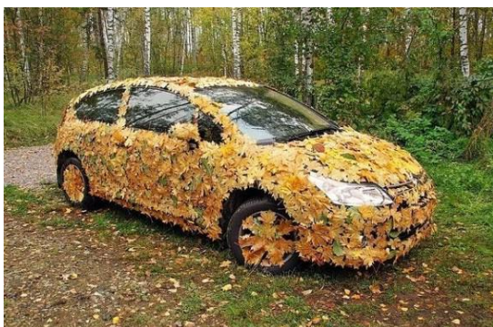
Advanced - camouflage!