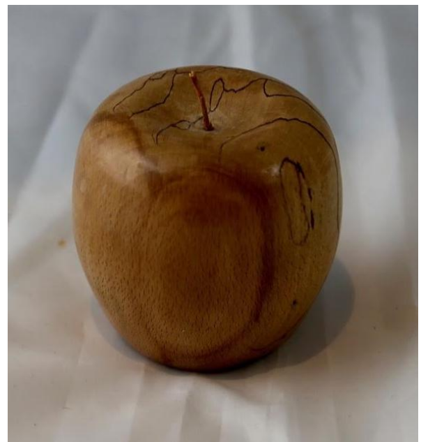
Jack Wright- 3rd Under-16 Section - Apple.