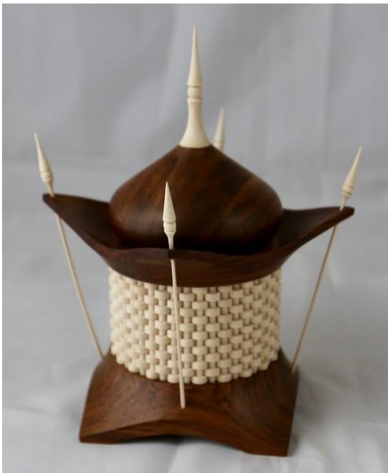
James Gallagher- 1st Spindle Section - in walnut & holly.