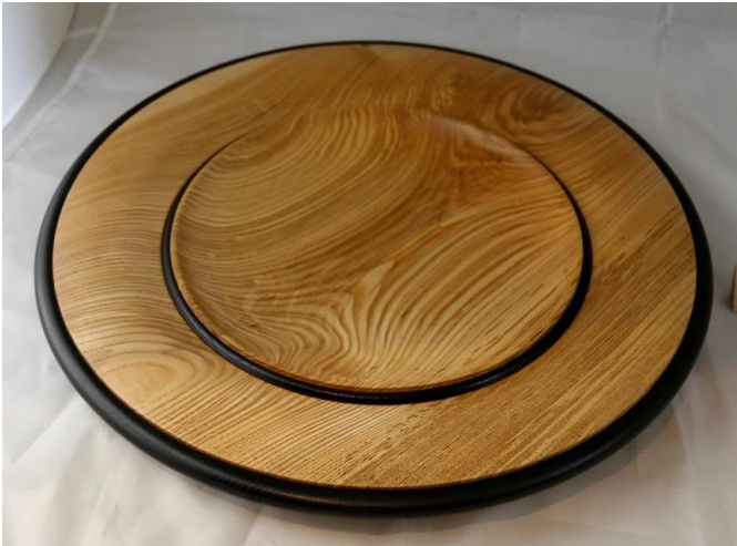
Pat Walsh - 1st Open Section - an olive & ash platter.