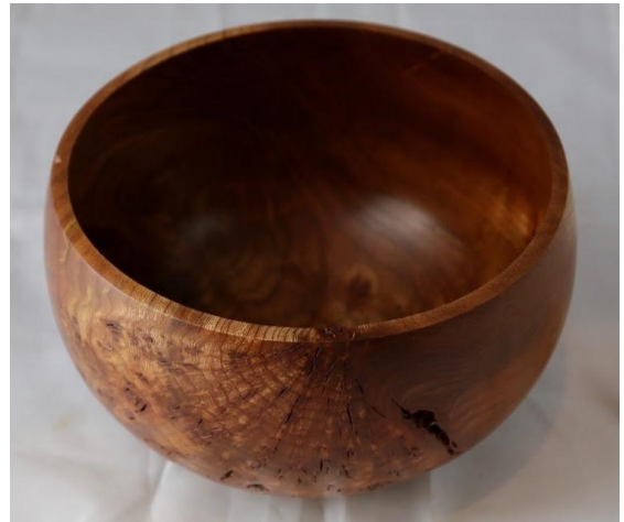
Pat Walsh - 2nd Open Section - an elm burr bowl.