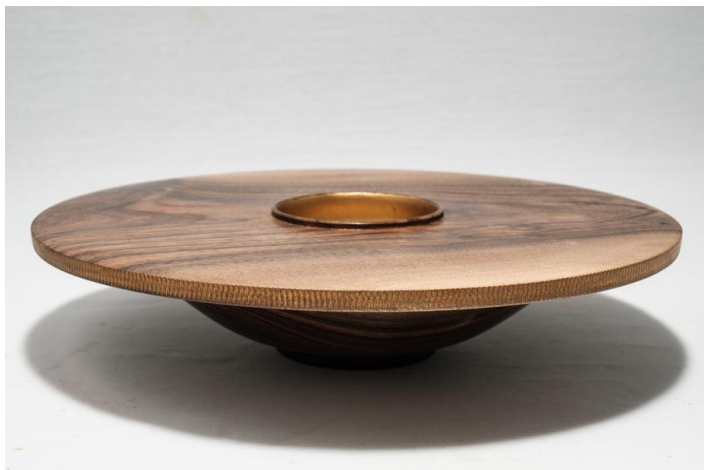
Cecil Baron - Artistic