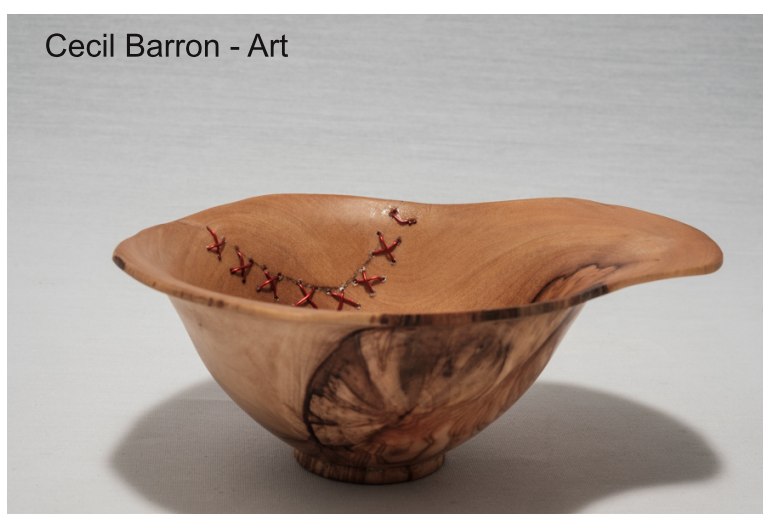
Cecil Barron - Art