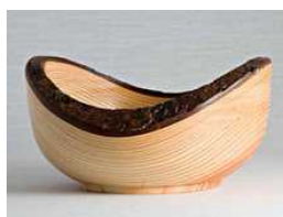
Exp - Paddy Finn