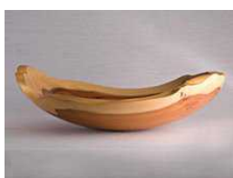
Adv - Henry East

Who were the winners 10 years ago - Sep 2007