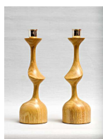
Adv - Seamus O'Reilly

Who were the winners 10 years ago - Oct 2007