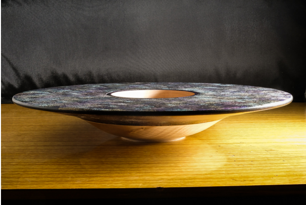
Pat Walsh - Artistic