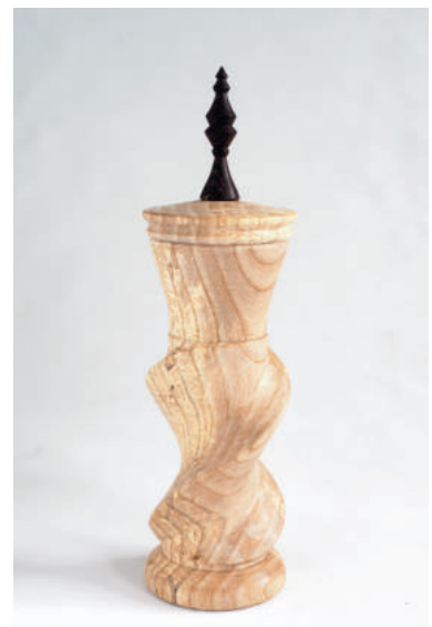
6th artistic Declan Corrigan